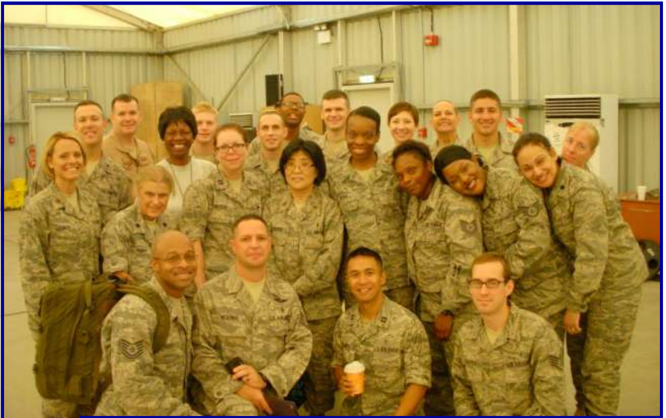
new Crew Bids Farewell to Predecessors, 380 EMDG