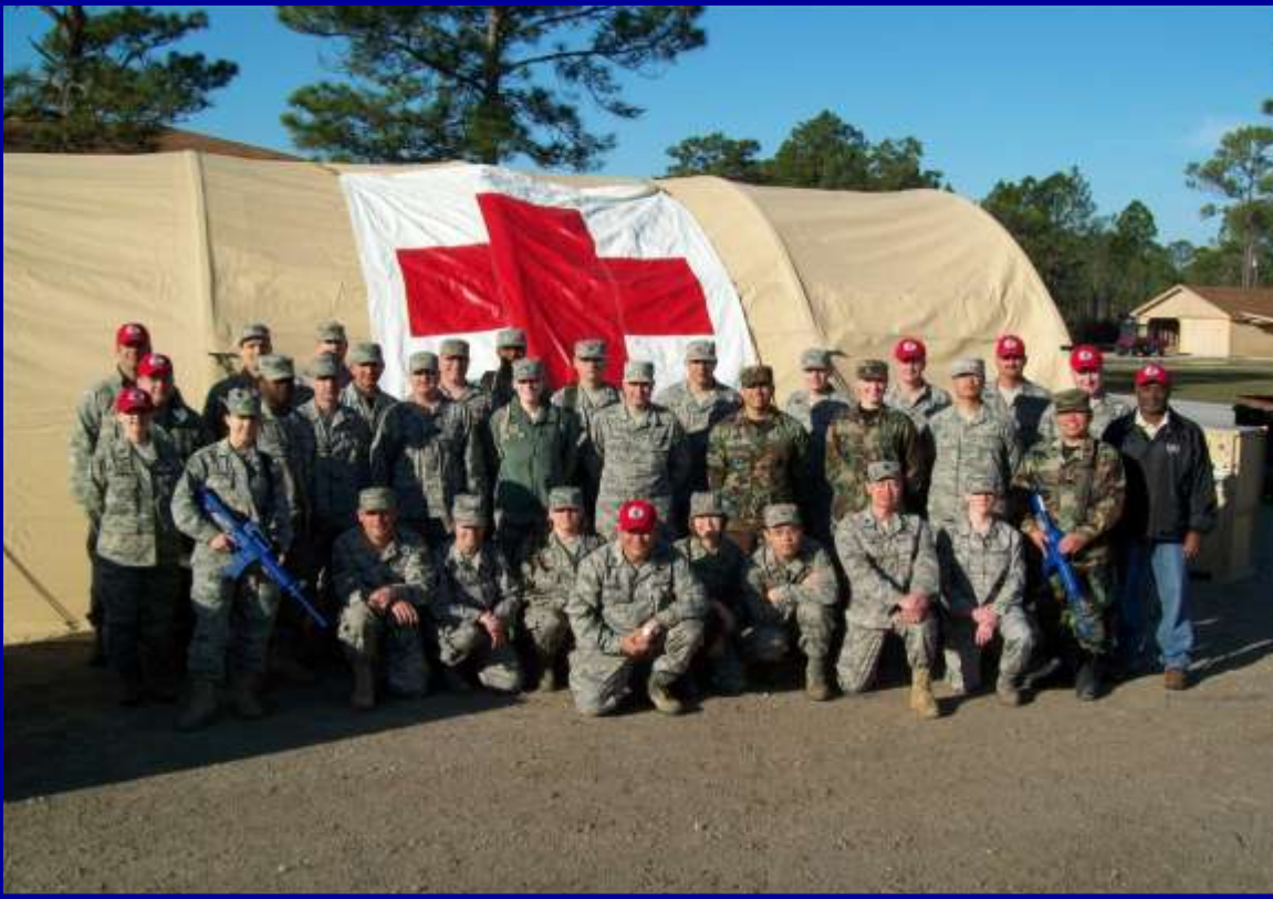
Silver Flag Exercise, Tyndall AFB