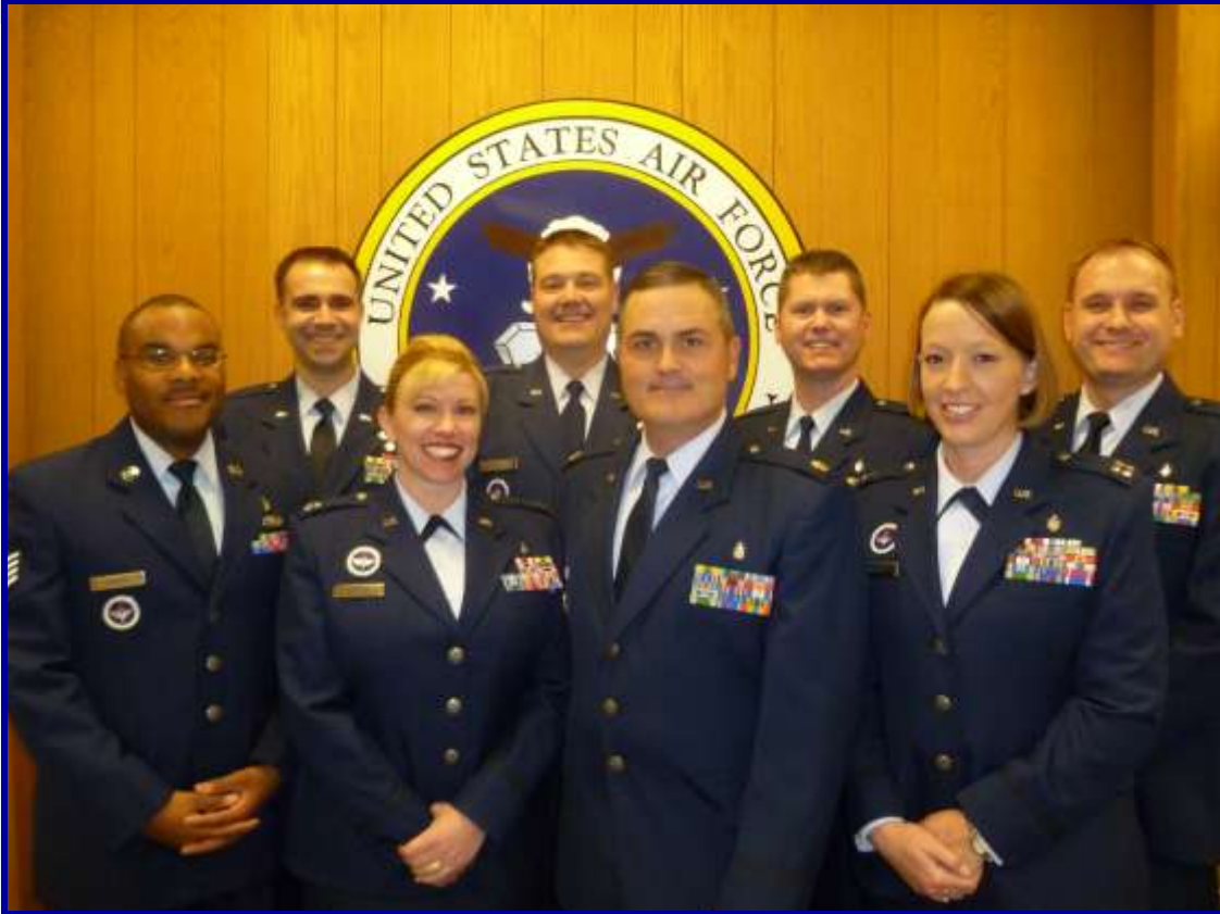
HSA School house Team, Sheppard AFB