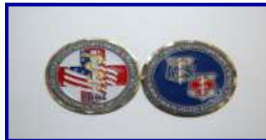
"A decade of Traditions" 2001 MSC/4A0/4A1/4A2 Coin...$8 Now $5